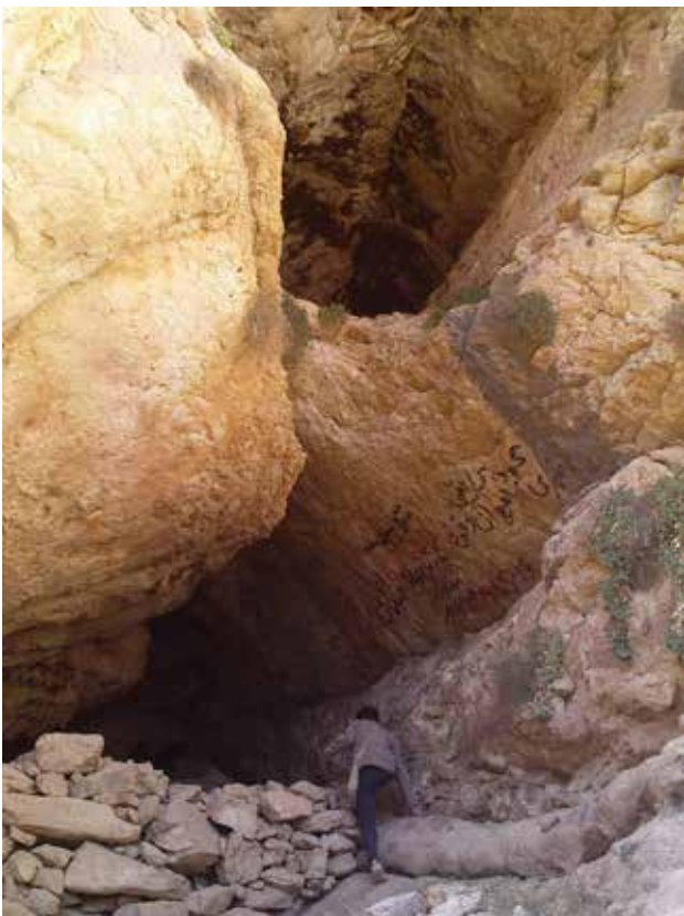
Figure 4. Entrance view of Tang-e Teyhooee Cave.

The paintings of Tang-e Tadavan Rockshelter are a panel of paintings containing 'animal', 'vegetable',