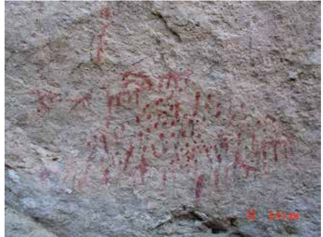
Figure 3. Pictograms in Tang-e Tadavan Rockshelter.

'human', wavy and other motifs. This includes an L-shaped arrangement of pictograms of a length of 1.5 metres and a width of 1 metre. There are some dotted figures located around and in the centre of this panel. Some wavy motifs are painted above this arrangement (which to us resembles a hunting scene) and some further marks can be observed around it. Some of the surrounding figures are fainter than the possible hunting scene and seem older (Fig. 3). The apparent subject matter of these paintings within Tang-e Tadavan Rockshelter is comparable with those in Eskaft-e Ahoo (the Eskaft of Gazelle) located in Bastak County, in Hormozgan (Asadi 2007).