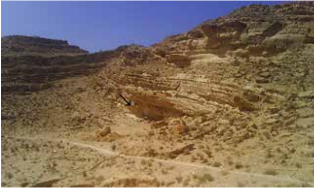
Figure 2. View of Tang-e Tadavan Rockshelter located on the edge of the Qare Aqaj river valley.

metres and a depth of 3.5 metres. So far, this area has been a seasonal habitat of various Arabian and Turkish nomad tribes in the autumn and winter. As it can be seen from their remains, nomads of this area have used this place for sheltering their livestock and people.