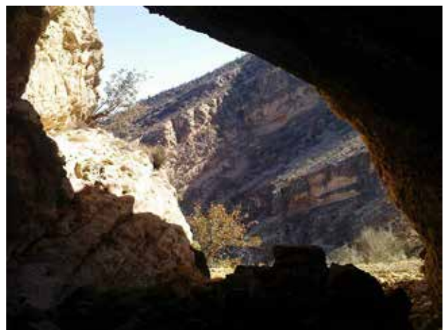
Figure 5. View from inside the cave.

Painted on the sides of the arrangement are the shapes of two anthropomorphs, which we interpret as hunters with bow and arrow. We emphasise that we have no ethnographic information about the meaning