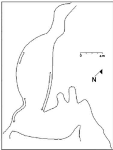
Figure 6. Plan of Tang-e Teyhooee Cave and position of the pictograms within the cave.

of these images and simply use our subjective imagination in these pronouncements.