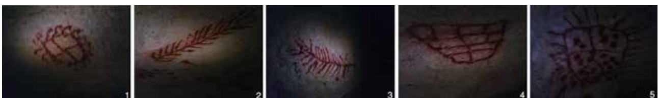
Figure 8. Pictures of various figures painted in Tang-e Teyhooee Cave.

Although estimating the age of these paintings is not conceivable at this stage, this cave's use is considered to have occurred in historical times. A few potsherds of