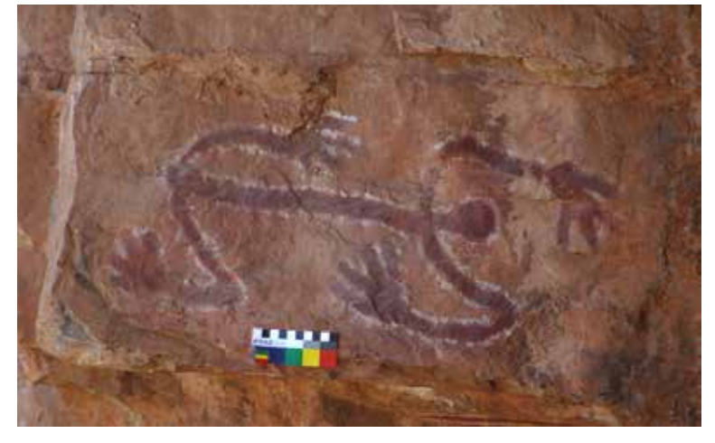
Figure 2. Red-infill and white-outline 'sorcery' figures, Paynimbi.

markings. For example, is there evidence for Gwion Gwion paintings in the Fitzmaurice region? Do the Dynamic Figures of western Arnhem Land spread into the region? Is the influence of symbolism derived from the desert observed in this coastal region?