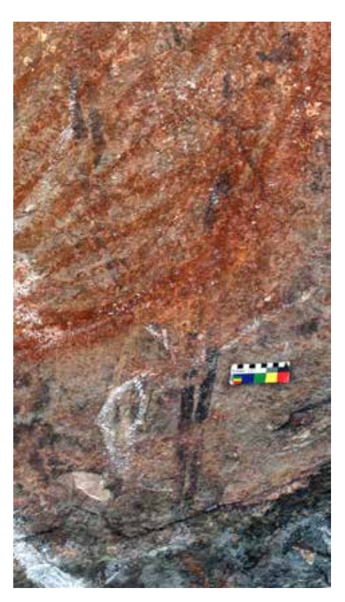
Figure 4. Remnant dark mulberry painting of a stick-like human figure with possible headdress and tassels superimposed by a large red brown painting at Kumil Shelter 2, the Stingray site, on the Fitzmaurice River.

Small samples of pigment and rock surface coatings were collected for dating by scraping material directly into plastic vials or onto aluminium foil using a dental pick. Those samples were sent to the ANSTO laboratory for radiocarbon assaying. Results are listed in Table 1.