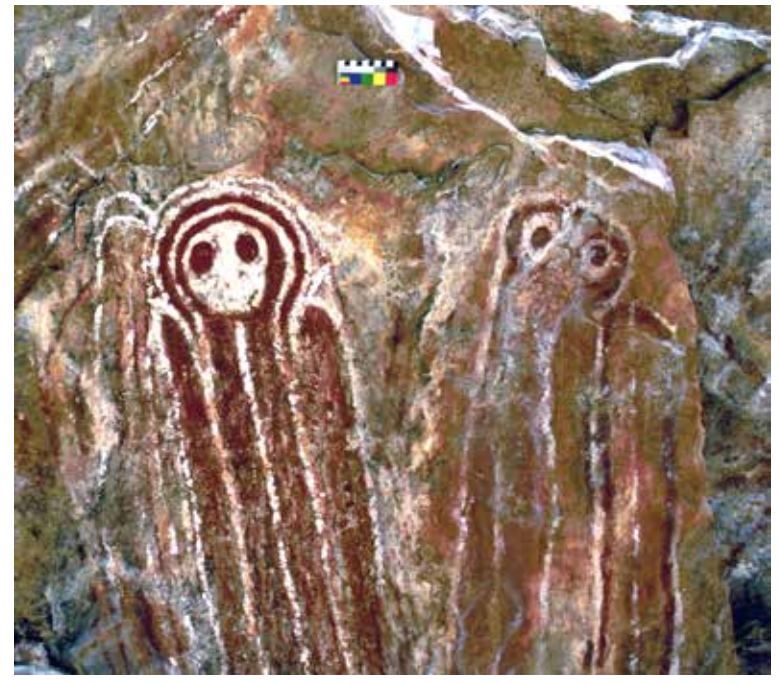
Figure 3. Two red-and-white paintings of anthropomorphs showing similarities to the 'Lightning Brothers' of Wardaman Country.

Several dark mulberry-red anthropomorphous figures (Fig. 4), with their elongate stick-like 'bodies', show strong similarities to the Gwion Gwion (Bradshaw figures) of the Kimberley (e.g. Ngarjno 2000), the Dynamic Figures of western Arnhem Land (e.g. Chaloupka 1993) and the Karlinga figures of the Keep River (Taçon et al. 2003). The Wadeye-Fitzmaurice figures