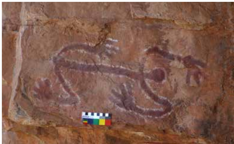
Figure 2. Red-infill and white-outline 'sorcery' figures, Paynimbi.

markings. For example, is there evidence for Gwion Gwion paintings in the Fitzmaurice region? Do the Dynamic Figures of western Arnhem Land spread into the region? Is the influence of symbolism derived from the desert observed in this coastal region?