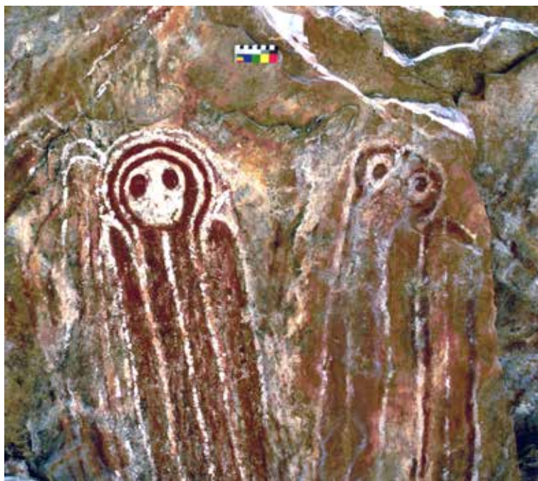
Figure 3. Two red-and-white paintings of anthropomorphs showing similarities to the 'Lightning Brothers' of Wardaman Country.

Small samples of pigment and rock surface coatings were collected for dating by scraping material directly into plastic vials or onto aluminium foil using a dental pick. Those samples were sent to the ANSTO laboratory for radiocarbon assaying. Results are listed in Table 1.