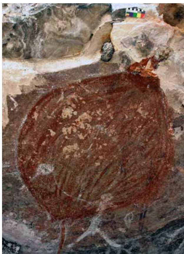
Figure 5. Paintings on the ceiling of the Stingray shelter provide details of the superimposition of images and their relative ages.

A mulberry-red stick-figure was dated to circa 4870 years BP. This compares with ages exceeding 4000 years BP for similar elongate mulberry figures known as the Gwion (Watchman et al. 1997). A Karlinga figure in the Keep River region gave an age estimate of 4060 \pm 210 years BP (Watchman pers. data).