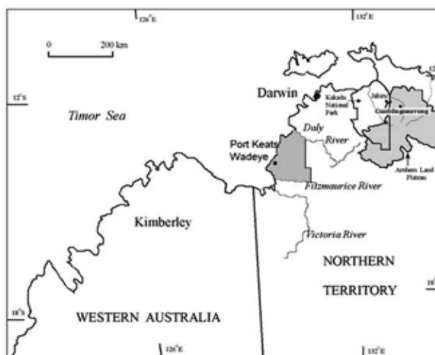
Figure 1. Location map showing the central location of the Wadeye-Fitzmaurice region between the Arnhem Land Plateau in the east and the Kimberley.

the Kimberley and western Arnhem Land regions, north of the Victoria River District (VRD) and west of the Katherine region (eastern VRD or Wardaman Country), all well known for distinctive rock art assemblages. It is a potential field of study for evaluating possible connections between different peripheral linguistic and cultural groups using rock