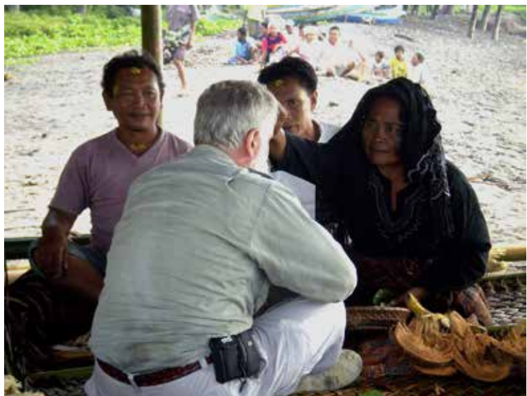
Figure 1. The author (with back to camera) participates in an elaborate ceremony conducted by a female shaman, in which she implores the spirits to protect a crew of twelve on an impending dangerous mission. All other men are devout Moslems, but for this purpose, the power of a shaman is decisively preferred.