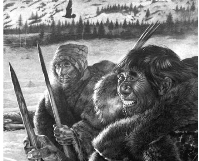
Figure 2. Neanderthals as seen by a contemporary artist, Giovanni Caselli. Are they any more accurate than the earlier rendition?

Saint-Césaire 1 femoral midshaft exhibits the