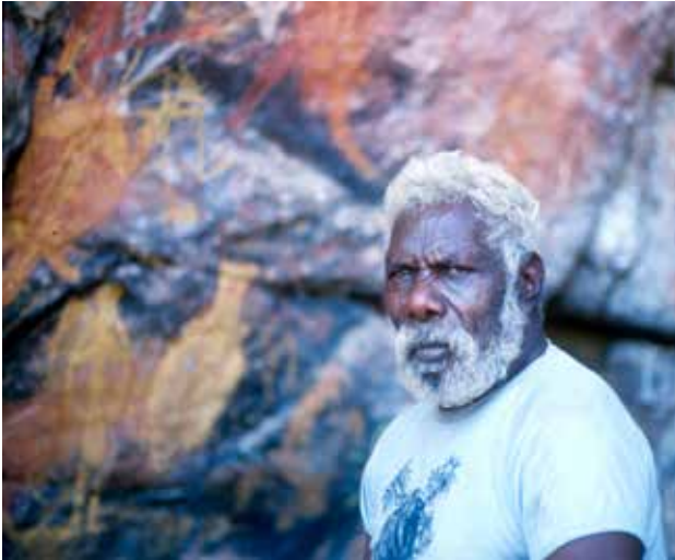
Figure 1. Big Bill Neidjie explaining the importance of rock art at Nadambirr ( Hawk Dreaming ), Northern Territory in June, 1986.

get bad luck (in Taçon 1989: 332; parentheses mine).