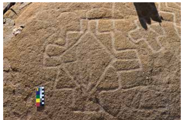
Figure 9. Andean cross-like petroglyph motif, Serrote do Urubu. Photograph by RV, 2016.

URUBU4: 4, 3, 3, 3 = 13/4 = 3.25 \mu\text{m} = \text{E516}+119/-40 years bp.