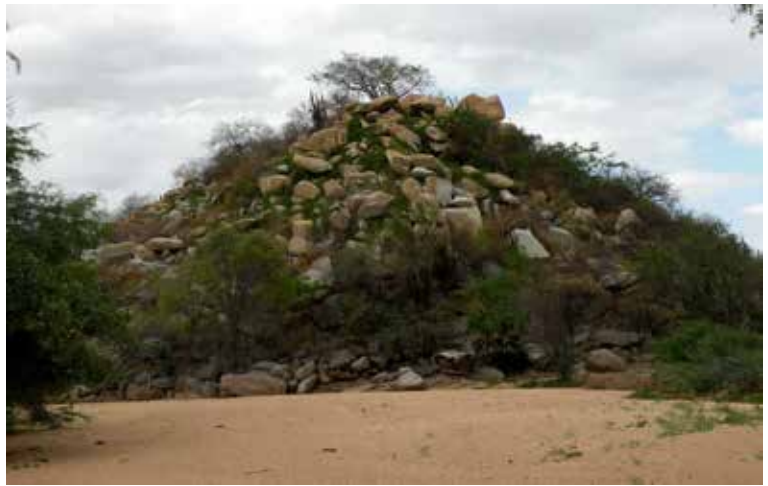
Figure 5. Fragmented rock formations of granite tors bearing petroglyphs, Santa Cruz Archaeological Site, municipality of Angicos, Rio Grande do Norte.

The second microerosion age estimate derives from a petroglyph situated on a sloping rock floor approximately 10 m west of the first boulder analysed and below it. The sampled petroglyph presents a long vertical line with many attached shorter lines, forming a branching pattern of arboriform morphology. Its deep grooves presented an excellent