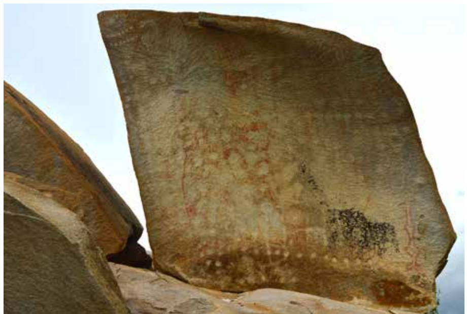
Figure 6. Rock paintings protected by a layer of silica, Santa Cruz Archaeological Site, municipality of Angicos, Rio Grande do Norte.

Another microscopically examined feature of the site was a panel with faded abstract red pictograms as well as numerous shallow cupules, the former surprisingly well preserved in the open-air semiarid context by the precipitation of a whitish silica skin over much of the vertical panel (Fig. 6). The deposition of soluble