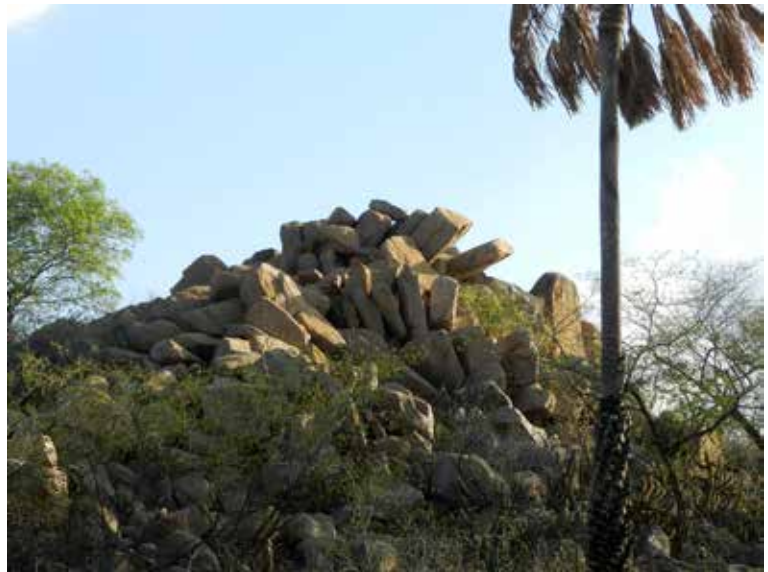
Figure 8. Hill comprised of granite tors, Serrote do Urubu, municipality of Pedro Avelino, Rio Grande do Norte.

URUBU2: 3, 3, 3, 4, 3 = 16/5 = 3.2 \mu\text{m} = \text{E508}+127/-32 years bp.