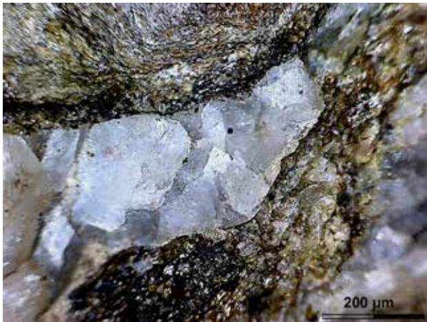
Figure 4. Microphotograph of micro-wane PAP2, located on the vertically aligned fracture edge immediately to the left of the black dot.

and at different times. No microscopic abrasion striae were found within any of the cupules, indicating that their very smooth floors are not the result of abrading action. This is consistent with all the world's cupules on hard rock types. Indeed, on certain sedimentary rocks, extremely high intensity of percussion can effect an annealing process forming tectonite layers through a process of kinetic energy metamorphosis and these can become almost inert to further impact (Bednarik 2015a, 2015b, 2016).