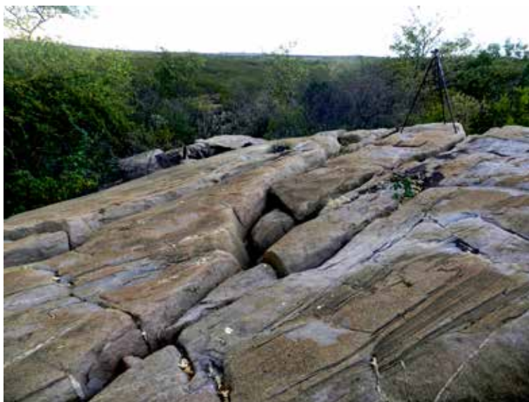
Figure 2. Sub-horizontal rock support of small elevation in gneissic granite with representations of petroglyphs from the archaeological site Açude das Flores III, municipality of Afonso Bezerra, Rio Grande do Norte, north-eastern Brazil.

The morphology, lithology and specific positioning on the granitic platform (minimal contact area) indicate the acoustic properties, suggesting a possible function of the structure as a lithophone, or a ringing rock. Such features are known in the traditional knowledge of the Brazilian Nordeste as pedra de sino (literally, a 'bell rock'), as they are also in many other parts of the world (Bednarik 2008). When struck with hard