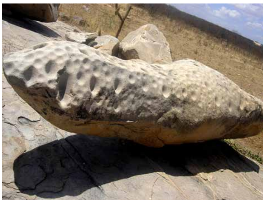
Figure 3. Elongate boulder bearing numerous cupules, at Serra do Papagaio III, municipality of Santana do Matos, Rio Grande do Norte.

Cupules constitute the most representative category of anthropogenic markings in the general site and are responsible for virtually all the markings on the presumed lithophone boulder. These cupules were made by direct percussion, with diverse numbers of blows