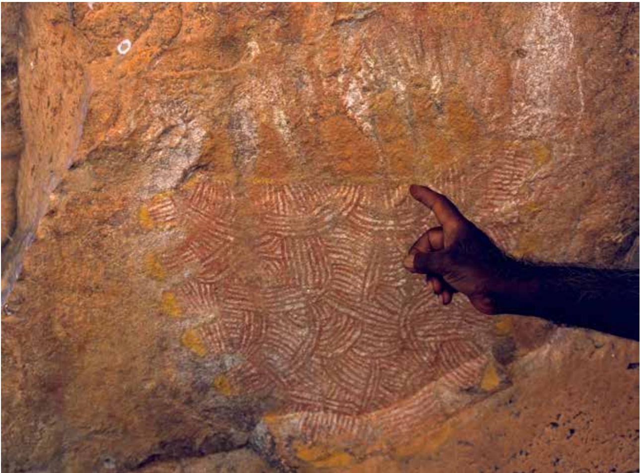
Figure 6. Food sharing icon at Anaut.ngarri dambun. Located within Jillinya's mamac (secret and sacred) sanctuary in Anaut.ngarri dambun, this venerated grid image represents the exchange and trade of food such as yams and waterlily. As with all the female imagery accumulated at this site, it is reported to have been painted by women.

perspective of the Aboriginal law expert recognised as munnumburra .