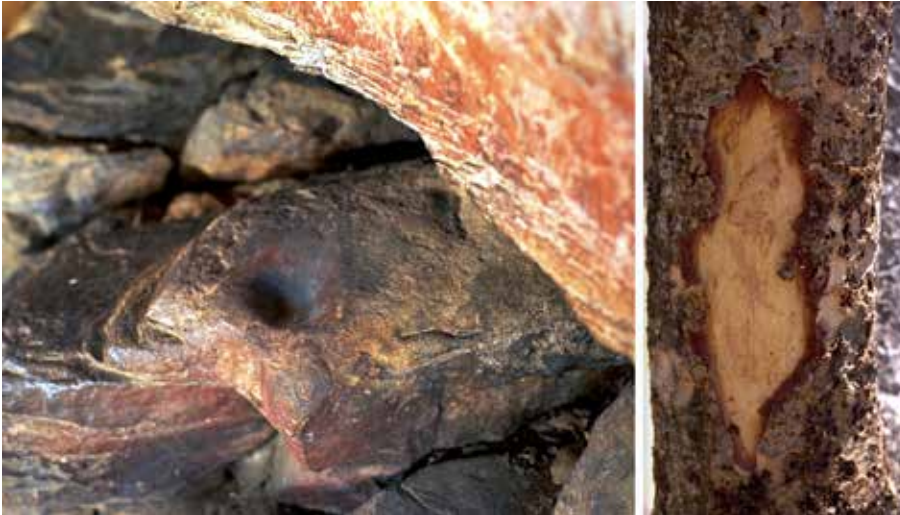
Figure 7. Left: norgun concave stone palette at Wulu.ngarri. Right: manandu bark cut to obtain sap.

invented by the Gwion. Three public titles for artists are heard in conversation among the munnumburra and commonly used to extend the meanings of their roles in social history: