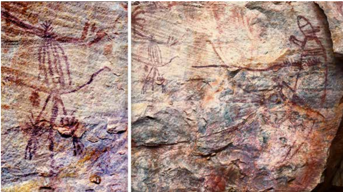
Figure 3. Yandama, the famous Gwion who invented the nyarndu ('spearthrower') seen in detail of the kangaroo-hunting icon at Alyaguma, southern Galery.ngarri dambun.

separate judgment when it became evidence for the Wanjina Wunggurr Willingin native title claim giving the claimants possession of all Wanjina and Gwion rock art 'against the world' (Ngarjno et al. 2000; Strelein 2006). 2