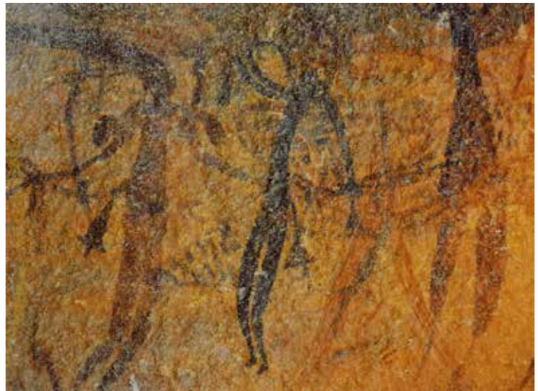
Figure 8. Guringe site in Anaut.ngarri dambun. This animated group scene depicts recurring ceremonial joining of men and women within Jillinya's maaaa sanctuary. The leading female is depicted dancing with arms raised in the praying mantis (mandzu) posture symbolic of Jillinya; this graceful female embodies the mandzu presence. Layered on top of earlier generations of similar imagery, the later painting is superbly accomplished and has long been kept secret by the Ngarinyin for its iconic stature.

Some key distinctions between male and female apparel are exemplified during the birrina , a joining-of-genders ceremony, when a male performer wearing