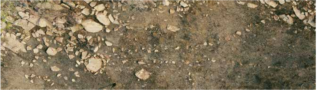
Figure 4. Aerial view of the stone table at Dududu.ngarri. Top of aerial image is north with a stone arrangement approximately fifty metres across. The Kimberley hosts known as Kamali were tribes with nomadic bird names and remain represented by seventeen named stones encircling the table. All the visiting tribes from the 'sunrise' regions to the east, from northern coast to central desert, form two long lines of jallala — signal stones. Stones arranged in circles and positioned west of the table represent coastal tribes and southern tribes.

who exemplifies the term of Munga.nunga for 'artist as visionary'.