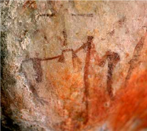
Figure 5. Image of sacred object exchange in north Galeru. ngarri dambun district. (The image follows the convex surface of the shelter wall.)

to their specific location and ancestral significance.