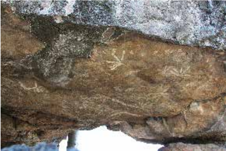
Figure 5. View of main part of rock art panel on ceiling of Castle Rock; weathered external surface of limestone rockshelter can be seen in upper foreground, and the trunk of a bottle tree ( Brachychiton australis ) can be seen through the other side of the shelter (this tree produces edible seeds); some of the variation in the star motifs can be seen, as well as the curving line of dingo paw prints just below and behind the shelter's front overhang.