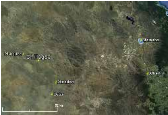
Figure 2. Satellite image of the Chillagoe-Mungana rock art district and the subdistricts of Almaden and Ootan, showing the locations of the townships of Atherton and Mareeba to the east as well, which also have ethnographic and archaeological evidence for connections with Chillagoe.