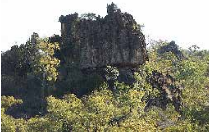
Figure 3. View of Castle Rock, Chillagoe, north Queensland, Australia, from the east; vegetation below site is mostly sclerophyll woodland, but softwood 'dry rainforest' vine thickets occur in the fire shadow of the limestone karst tower; that is, there are many food and medicinal plants concentrated near the site and on the karst tower (image: OCR).

non-figurative motifs, especially lines, grids, circles and star-like shapes. The motifs of the region contain relatively few anthropomorphic and zoomorphic designs, as well as few stencils of material culture items and few hand stencils. There is little superimposition of paintings on the rock surfaces, and a limited range of pigments is used, with primarily monochromatic painting and drawing in red ochre (haematite and jarosite), yellow ochre (goethite), white clay (kaolinite) and wood charcoal. Painting events span at least from 29 700 BP to the modern period (see Campbell et al. 1996; Watchman and Campbell 1996; Campbell 2000). The stylistic characteristics of the motifs exhibit chronological stability, and the majority of visible motifs are thought to date to the Holocene.