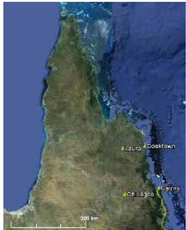
Figure 1. Satellite image of north-eastern Australia showing the locations of Chillagoe, Cairns, Laura and Cooktown; the yellow line represents part of Australian national route 1; the northern section of the Great Barrier Reef World Heritage Marine Park can also be seen on the right-hand side of the coastline (image: Google Earth).

The characteristics of the Chillagoe-Mungana rock art region that have been previously determined include an overwhelming predominance of abstract and geometric,